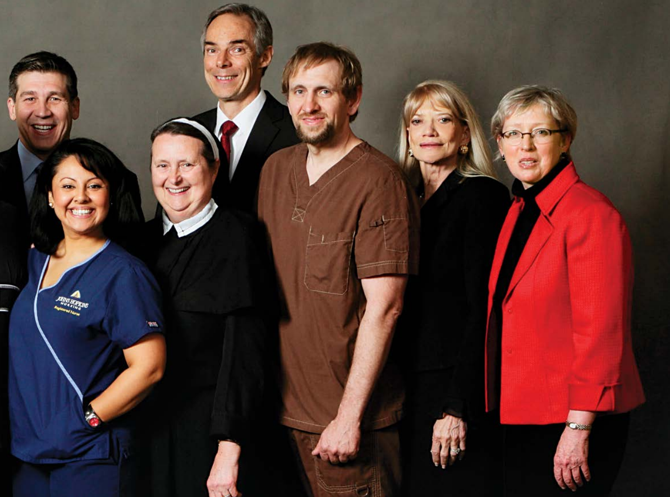
The American Nurse Project